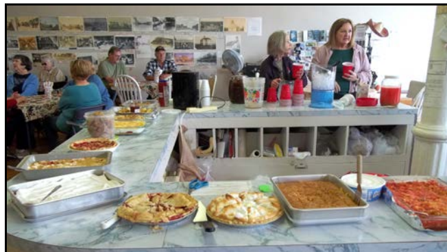
June Rhubarb Fest: The counter is full of rhubarb goodies to share.

*We sponsored free-swim Saturdays for the month of July at the Glasco swimming pool. The Glasco Recreation Board continued free-swim Saturdays for August.