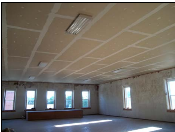
Dance Hall on the upper floor of the Corner Store is ready for renovation. We have plans for a stairway, new door on the west, HVAC and ceiling preparations for painting.