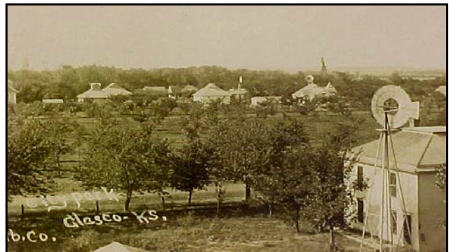
From the top of Studt's, looking south to the park, 1908.

We maintain our original vision of how best to be a community foundation. We believe the best way to serve the community is to be a community foundation. That is, to be as inclusive as possible, all working together.