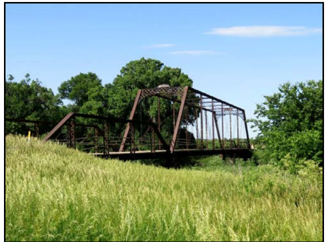
The old river bridge is currently closed to vehicular traffic.

*A board member would welcome an invitation to visit with you about the Foundation. Estate planning that includes Glasco Community Foundation will help secure Glasco's future.