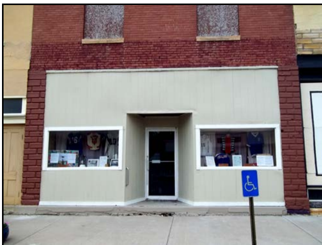
The Balog building isn't empty; it's full of potential!

*The Foundation now owns the Balog building and we are hopeful it can be put into service soon. The roof will be the first task. Rent it. Own it. Anyone interested?