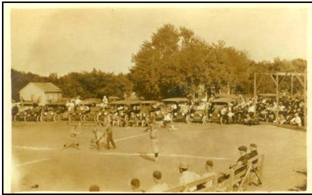
Baseball in Glasco, 1916

The GCF is a 501(c)3 non-profit organization; therefore all contributions are tax deductible.