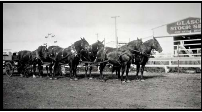
Glasco Stock Show/Cloud County Fair, date unknown

Through the years, we have received significant gifts in memory of friends and family who have passed. These gifts bring to mind the special relationships forged with the community.