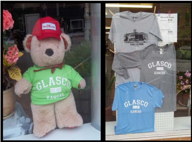
Glasco, KS and Glasco High School t-shirts are $12; long-sleeved $15

This May 2023 newsletter continues our membership outreach for 2023. Please join us in this venture. Become a Hometown partner. Your membership and donations are what make this work! We can do so much together.