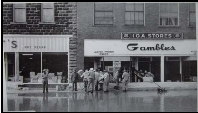
Studt's and Gambles on Main Street, July 1951

The Glasco Community Foundation was created to help friends of Glasco work to preserve and maintain community assets.