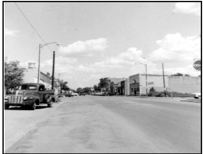
Looking east on Main Street, before the Post Office was built. Circa 1960.

We maintain our original vision of how best to be a community foundation. We believe the best way to serve the community is to be a community foundation. That is, to be as inclusive as possible, all working together.