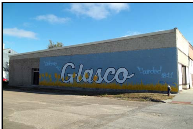
New mural on the old liquor store

This November 2021 newsletter begins our membership outreach for 2022. Please continue with us in this venture. Your membership and donations are what make this work! We can do so much together.