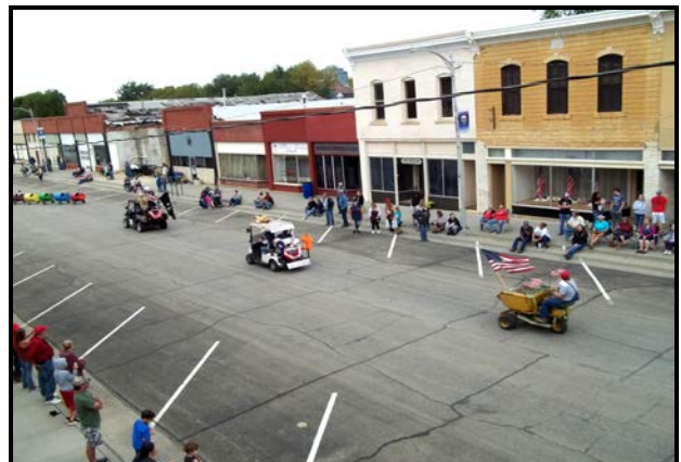
Fun Day Parade