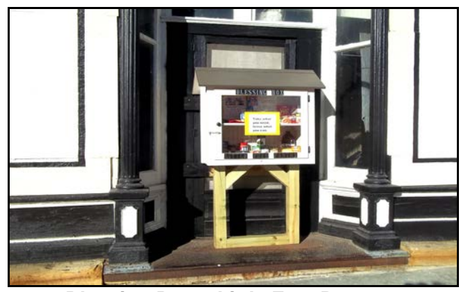
Blessing Box – Little Free Pantry

*A grant through the River Valley Extension Office provided a Blessing Box, installed last fall in the doorway of the Biggs building. The contents are ever changing and available to everyone. The Corner Store also maintains the local Food Bank.