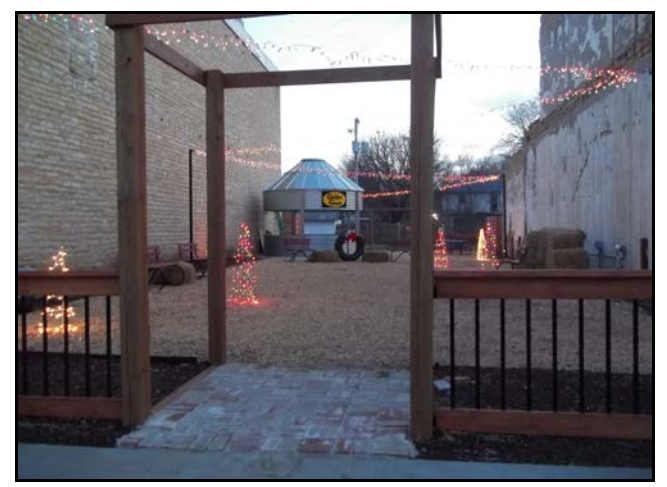
The Pavilion Christmas lights added to the downtown decorations.

Community Asset #1: The Built Environment Main Street has changed in recent weeks. We lost the Lott & Stine building because it was too far gone to save. It was built after the 1911 fire. The gap feels like a missing front tooth. In the lot next to the Corner Store, a public pavilion has come together and is an asset for the downtown. It will be used more as the temperatures allow.