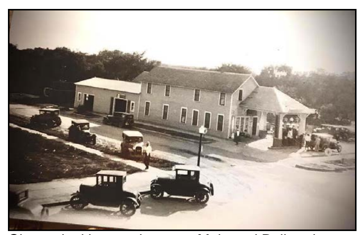
Glasco: looking southwest at Main and Railroad

This May 2021 newsletter continues our membership outreach for 2021. Please continue with us in this venture. Your membership and donations are what make this work! We can do so much together.